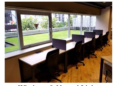
Windows & Natural Light