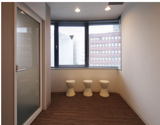
Visitor Waiting Area