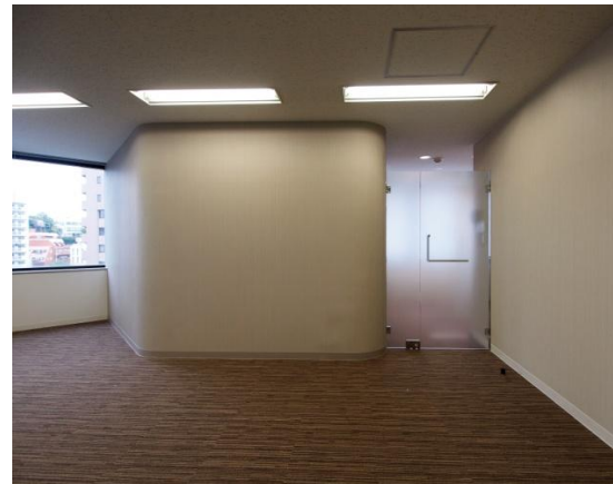
Earth-Toned Interior Design