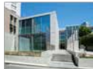
Ichigo Motoazabu Building