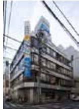
Ichigo Yokohama Nishiguchi Building