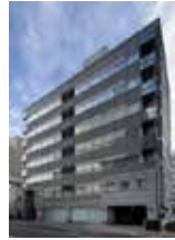
Ichigo Saga Building