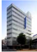
Ichigo Meieki Building