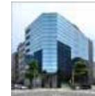
Ichigo Nishiki Building