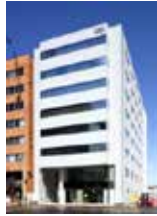
Akita Sanno 21 Building